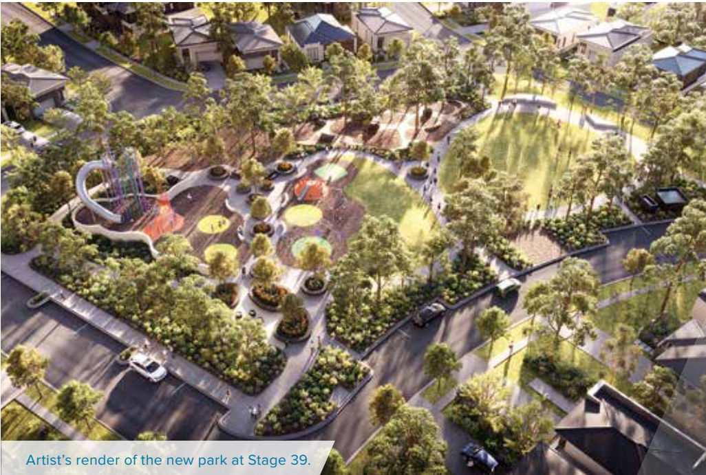
Artist's render of the new park at Stage 39.