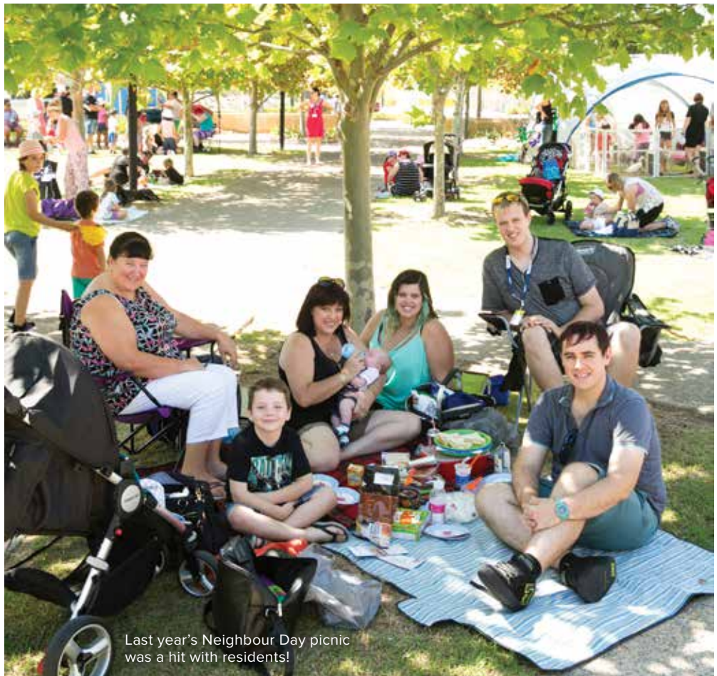
Last year's Neighbour Day picnic was a hit with residents!

The Neighbour of the Year Award will be presented at a special barbecue breakfast on Sunday 3 April 2016. Keep an eye on The Village at Wellard Residents Association Facebook Page for time and location details closer to the date.